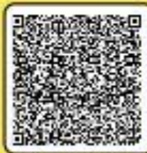
Scan for Location