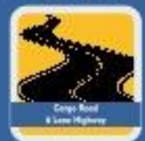
Congo Road & Loop Highway