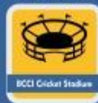
BCCI Cricket Stadium