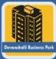
Devanahalli Business Park

4 passport size photos, Address Proof, PAN Card, Payment Cheque